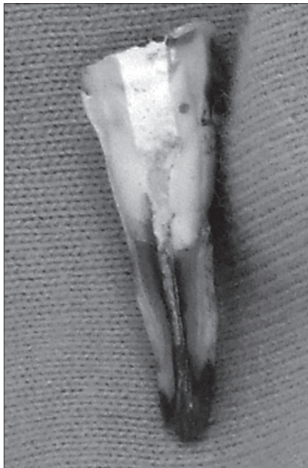
Figure 2. Dye penetration in teeth obturated using Apexit and gutta-percha softened in chloroform

Slika 1. Linearni prodor boje kod zuba opturisanog pastom AH Plus i gutaperkom razmekšanom u hloroformu