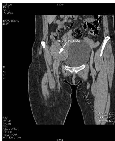
Fig. 2 – Lymph nodes conglomerate (parailiac right region).

On May 7, 2014 CT examination was also performed. It revealed conglomerate of enlarged lymphnodes, now 120 \times 65 mm in size, in the parailiac right region, imprinting right bladder contour (Figure 2). Enlarged lymph nodes were found too in left-sided inguinal region, 15 mm in diameter.