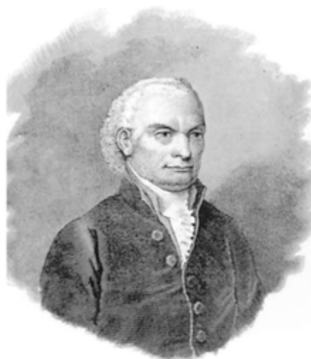
Fig. 2 – Domenico Cotugno (1736–1822).

Concept of cerebrospinal fluid (CSF) is closely linked to historical and medical development of meningitis. It is now known that the CSF is fluid that fills the subarachnoid space of the brain and spinal cord, and brain ventricles 1 . It is believed that Imhotep, an Egyptian doctor, and the notary, was the author of papyrus from 3000 BC, and the first one who discovered intracranial CSF. Name of cerebrospinal fluid was introduced by Francois Magendie (1783–1855), French physiologist, in the first half of the 19th century. Nicolo Massa (1485–1569), an Italian anatomist, in his book "Liber Introductorius Anatomiae" in 1536 was the first who described the CSF with cerebral chambers, based on autopsies. Previously, it was thought, by the beliefs of Hippocrates and Galen, that the brain ventricles contained "spirit of animals". It is generally accepted in medical history that the CSF was discovered by Domenico Felice Cotugno an Italian physician (1736–1822) (Figure 2). This famous doctor who lived in Naples in the 18th century published a paper, when he was 25, about the anatomical structures of the ear. He stated that not only were brain ventricle but the subarachnoid spaces filled by CSF, which was called "liquor cotunii" 8,9 .