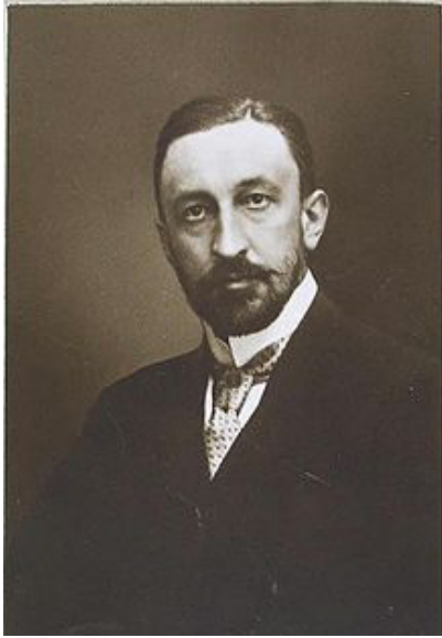
Fig. 6 – Jozéf Brudziński (1874–1917).

Jozéf Brudziński (1874–1917) (Figure 6) was a Polish doctor, a pediatrician. After World War I, he renewed the Polish University in Warsaw, and was appointed as a director of the same. In that time, Brudziński released four manu-