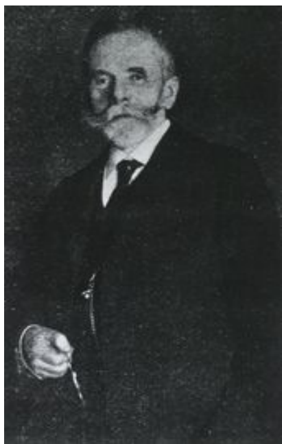
Fig. 3 – Heinrich Irenaeus Quincke (1842–1922).

physician Heinrich Irenaeus Quincke (1842–1922) who presented his experience at the Conference of Internal Medicine in Wiesbaden, Germany. In the United States, the procedure was implemented in 1891 by Arthur H. Wentworth in the children's hospital 12 . Winter's technique was involved in making incisions in 2nd lumbar region, such as major cut and placing a tube with a rubber drainage and so knocked infected content and reduced the pressure 13 (Figure 4). Also, he measured the level of sugar and protein in the cerebrospinal fluid, describing low sugar in purulent meningitis. He found of the tuberculosis Mycobacterium tuberculosis in the CSF and thus diagnosed tuberculous meningitis 14 .