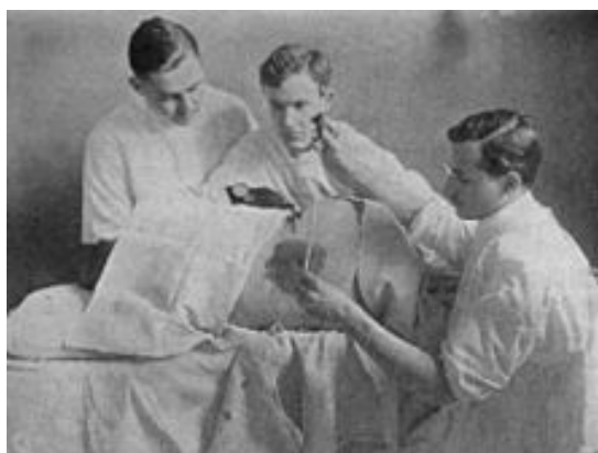
Fig. 4 – Lumbar puncture, at the beginning of the 20th century.

physician Heinrich Irenaeus Quincke (1842–1922) who presented his experience at the Conference of Internal Medicine in Wiesbaden, Germany. In the United States, the procedure was implemented in 1891 by Arthur H. Wentworth in the children's hospital 12 . Winter's technique was involved in making incisions in 2nd lumbar region, such as major cut and placing a tube with a rubber drainage and so knocked infected content and reduced the pressure 13 (Figure 4). Also, he measured the level of sugar and protein in the cerebrospinal fluid, describing low sugar in purulent meningitis. He found of the tuberculosis Mycobacterium tuberculosis in the CSF and thus diagnosed tuberculous meningitis 14 .