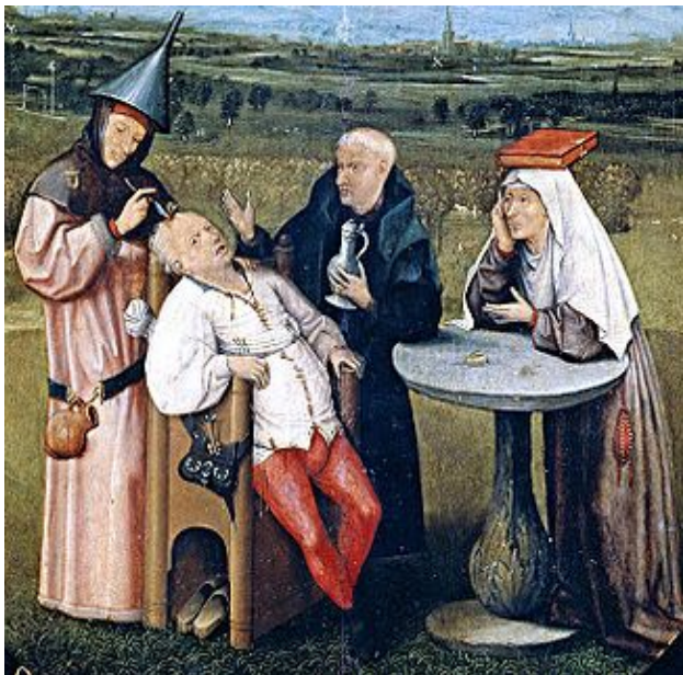
Fig. 1 – Trepanation – The Extraction of the Stone of Madness (a painting by Hieronymus Bosch).

the patient of evil thoughts and demons, the latter in some parts of our country, during the 19th century, the whole process had an element of vendetta. Particularly interesting is the fact that a high percentage of these patients, underwent surgery, and survived without the inflammatory process of the brain and meninges. A staggering figure when one considers that the intervention was performed by opening the skull, with unsterilized instruments, on which occasion would perpetrator watch brain membrane and thus establish "if it is dropped blood to the brain" (Figure 1) 5,6 .