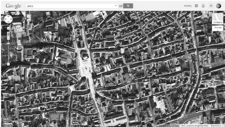
Photo 7. Pecs, medieval city core

Pecs has a very exclusive city core and consequent socialist urban developments, Szeged has a strict „gründerzeit” city form in the historic city and a vaste, almost perfectly arranged „socialist” developments on the southern Tisa side and to the east, Graz has a beautifully preserved medieval city core and imaginative „gründerzeit” developments with a great tradition of the city living qualities, on top of it the architectural expressive school of the contemporary urban planning period.