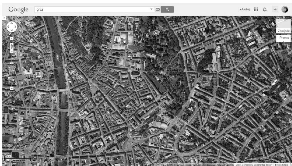
Photo 1. Graz, medieval core and „Gründerzeit” urban structures aerial view

Basically, the city development traceable periods show four distinctive city fabric shapes / periods that were defined by its main characteristics: the “core” period reveals the city founding principles; the “gründerzeit” city flourishing period of the Austro – Hungarian rule shows the stage of civil society expansion; the “socialist” period witnessed the power of the dictated development; and the “turbo - urban” period leaves us with what the postmodern and contemporary urban management principles (or the absence of them) have done to the city fabric.