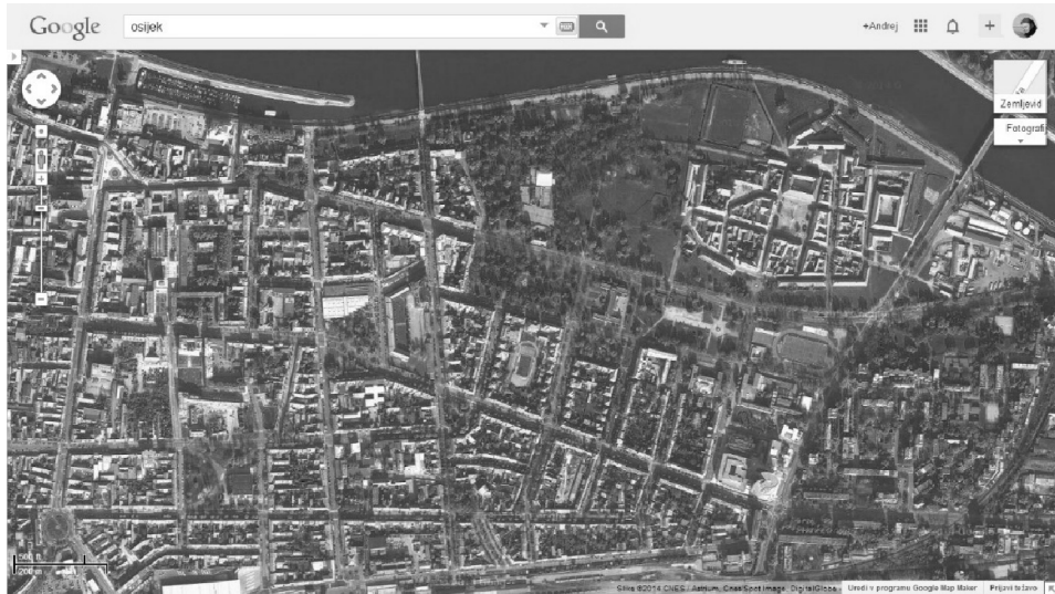
Photo 2. Osijek „core”and the „Gründerzeit” developments

the others with the clean regulated street line and facade and totally intimate individual backyards. The “socialist” period witnessed the power of the dictated development – in Osijek the developments of this period were obviously “greenfield” designs.