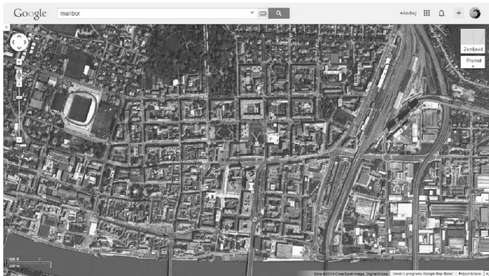
Photo 5. Maribor medieval core and the blocks of the „gründerzeit" period

The city "core" is medieval and very typical; like the cities of the southern german tradition the urban core is a walled city of relatively distinct quadratic structure. The interesting on the open space development are the contents of the city squares; their characters define the city extensions of the "gründerzeit" period.