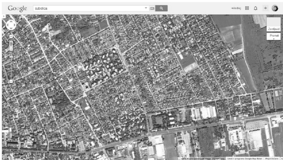
Photo 4. Subotica fabric; the "socialist" development is „consumed" by the neighbourhood