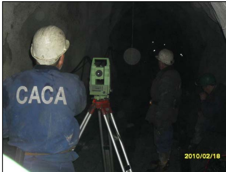
Figure 1 - Application of Total Station LEICA TCR 805 in Sasa mine

Big advantage of this surveying instrument is that it did not need any trigonometric forms for registration of measured values (angles, lengths), because the same are stored and processed in the instrument and as output data are obtained coordinates and elevations of all measurement points. Then the measured data very quickly and easily converted into a computer and processed by the famous program for drawing AutoCAD.