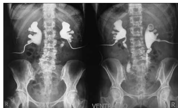
Figure 3. Bilateral antegrade pyeloureterography shows good renal drainage after ileal ureteral replacement