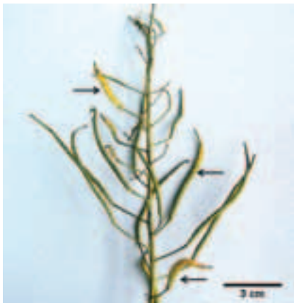
Figure 4. Damaged pods of oilseed rape change their colour, often deforming, drying and cracking

During our examination of infested pods, special attention was paid to detecting damage caused by the cabbage pod weevil Ceutorhynchus assimilis , (syn. C. obstrictus ), which is important for infestation intensity of D. brassicae . In this study, damage caused by that weevil species was not observed. A single larva of C. assimilis was found in the total of 773 examined pods, so the correlation between these two species was not determined. Similar observations had been reported in the Czech Republic (Kazda et al., 2005), while other literature data show that the midge uses openings made by C. assimilis for oviposition (Åhman, 1987; Pavela et al., 2007; Aljmlj, 2007; Williams, 2010).