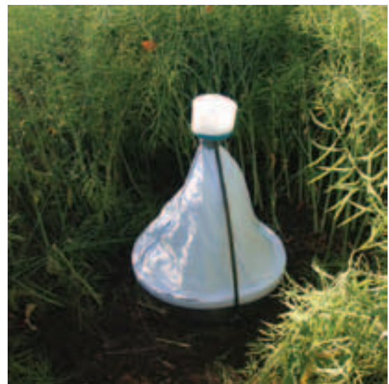
Figure 2. An emergence trap used to monitor the emergence of D. brassicae from the ground

D. brassicae midges developed two generations per year on the trial site and overwintered in the larval stage in cocoons in soil, as they do in most other European countries (Williams et al., 1987; Ferguson et al., 2004;