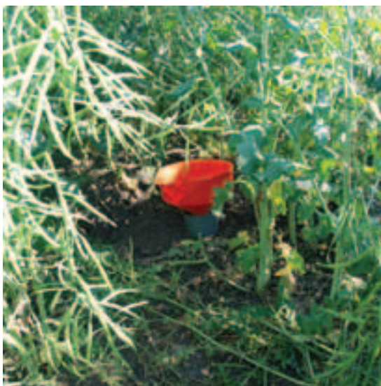
Figure 1. A funnel trap used to monitor the time when larvae leave pods and go into soil

Yellow Water Traps (YWT), Syngenta type, were used to detect the emergence of first generation adults of D. brassicae . They were set up in four places in the middle of the field at 50 m distance.