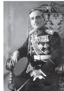
ALEXANDER KARADJORDJEVIĆ (1888-1934)