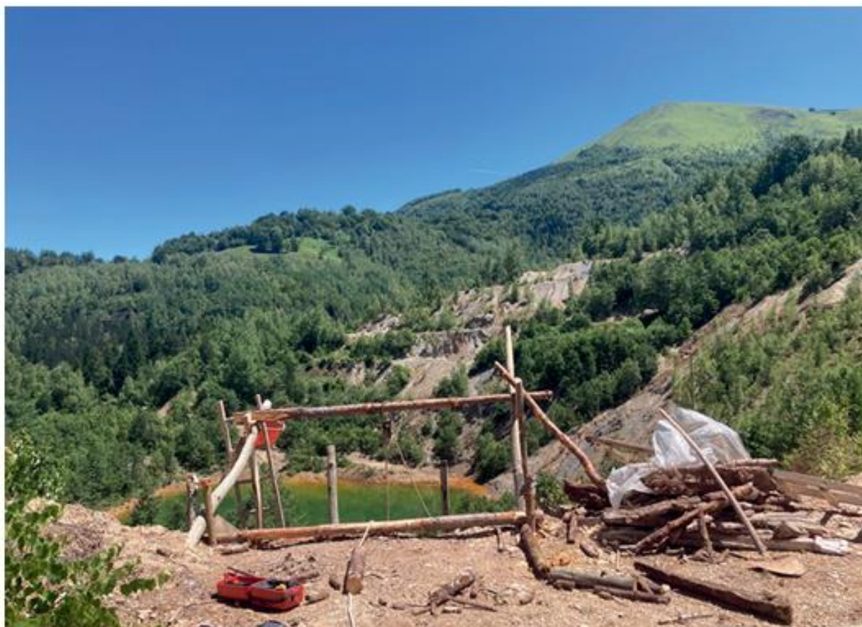
Figure 3. Brskovo, area of medieval mining activity, archaeological research in 2023.