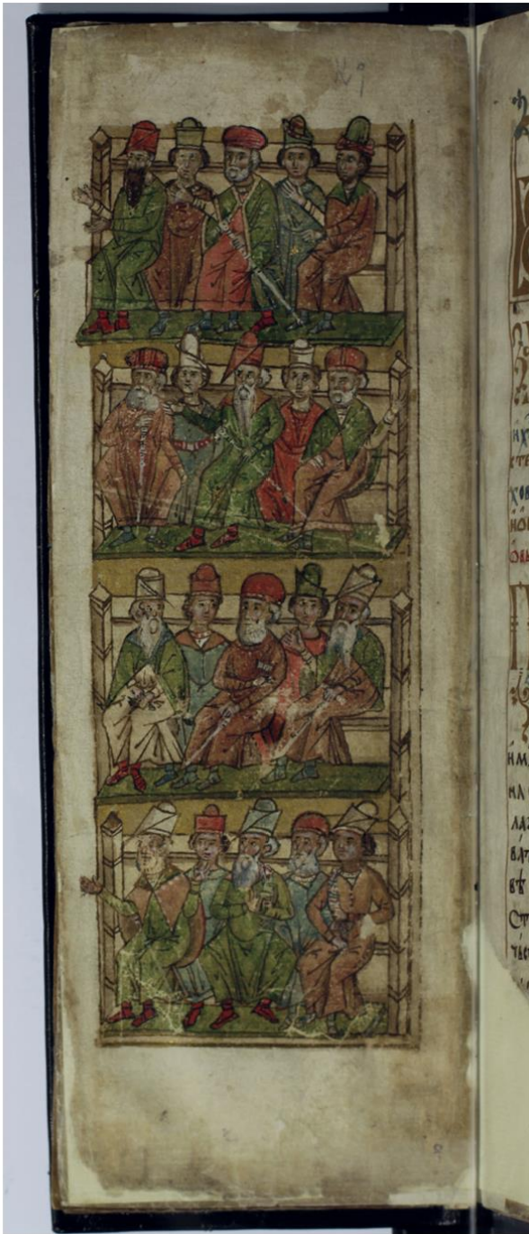
Figure 1. Illustrated transcript of Despot Stefan Lazarević's Code on Mines from the 16th century, Collegium of Mining, Archives of the SASA 465, sheet 2v. The Code itself dates back to 1412.

580-585; Fostikov and Rokai, in the process of preparation). Figure 1 Figure 2