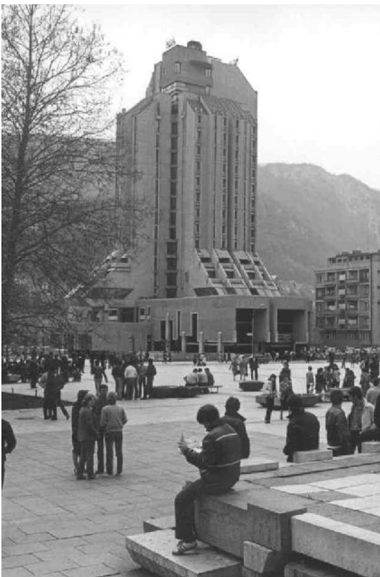
2 - ” “ (1980)