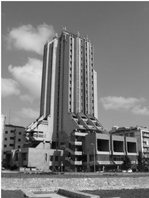
3 - „“ (2014)