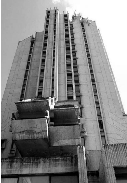
5 - " (2014)