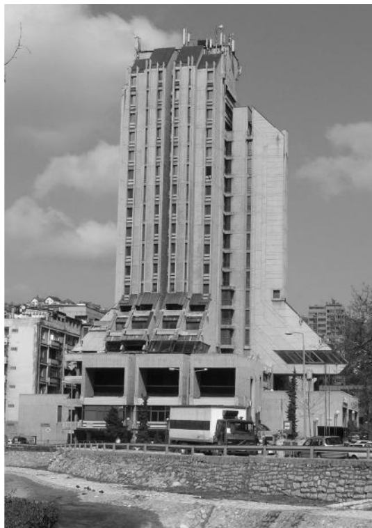
4 - „ „ “ (2014)