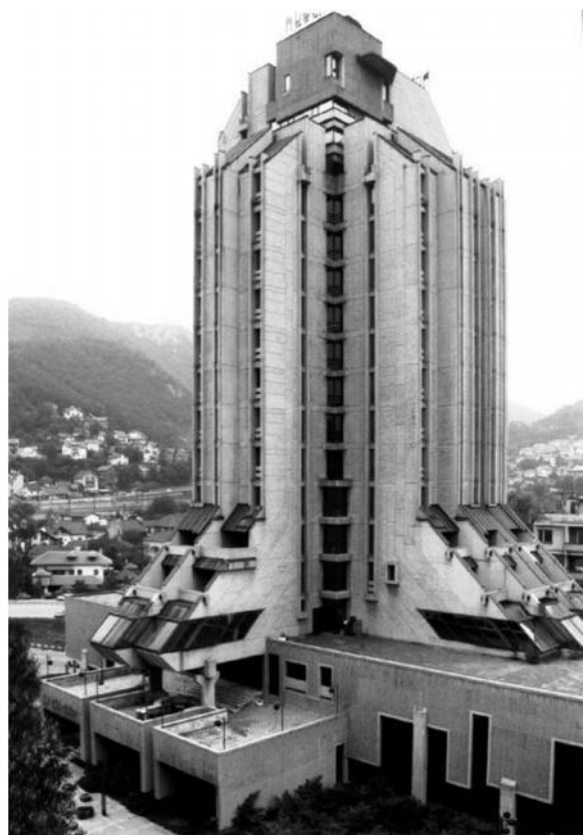
6 - " (2014)