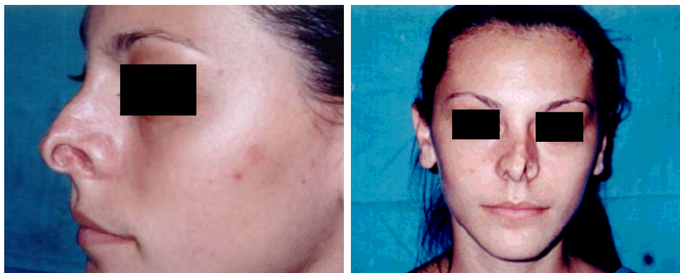
Fig. 4 – Preoperative view of the patient (case 2) – huge cleft of the left alar rim unevenness of the alar cartilage on both sides