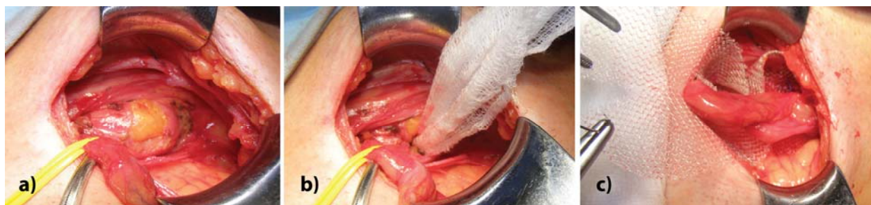
Fig. 1 – Original non plug technique of bilayer patch device insertion for repairing of indirect inguinal hernia: a) medial approach from the inferior epigastric blood vessels in Hesselbach's triangle through small incision of about 15 mm; b) application of underlay patch with moist gauze in preperitoneal space (space of Borgos); c) the small Y incision on the longest diameter on the onlay patch on about 15 mm from the connector and the spermatic cord placed through it.

sutured with usually six Prolene 2.0 stitches. The operation was finished with the skin sutured.