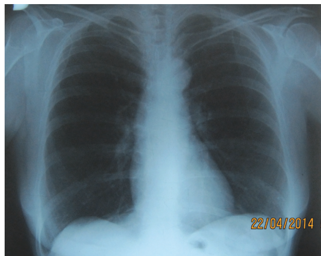
Fig. 2 – Lung X-ray after application of rituximab.