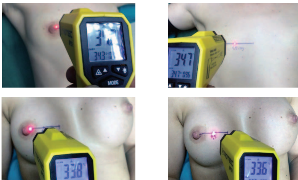
Fig. 2 – Breast skin temperature measurement by infrared thermometer at two points. Up: preoperation; down: postoperation in the same patient.