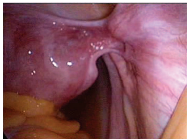
Fig. 2 – Laparoscopic appearance of a normal uterus, the right ovary and Fallopian tube are absent.