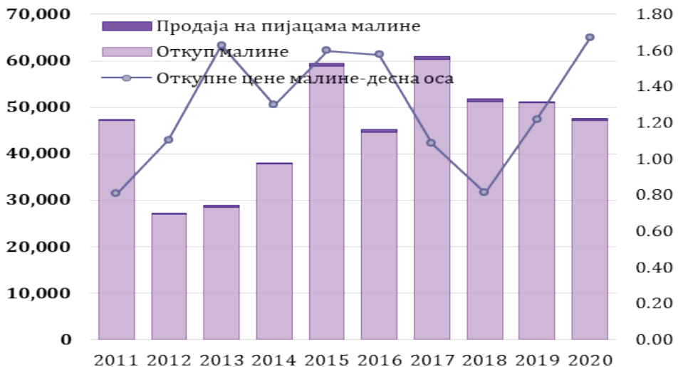
Graph 2. Purchase of raspberries and sales at markets