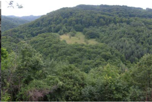
Figure 2. Predejan river, 2013 year