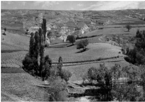
Figure 1. Brnjarska river, 1953 year

Excessive erosion affected 28.44% of the total surface area. There were numerous gullies and landslides, and in some places layers of soil were stripped away exposing the parent rock. Processes of severe erosion (with gullies of up to 50 cm deep and a lot of fine and coarse skeletal material on the surface, landslides on deforested areas) affected 544.93 km 2 (31.45%).