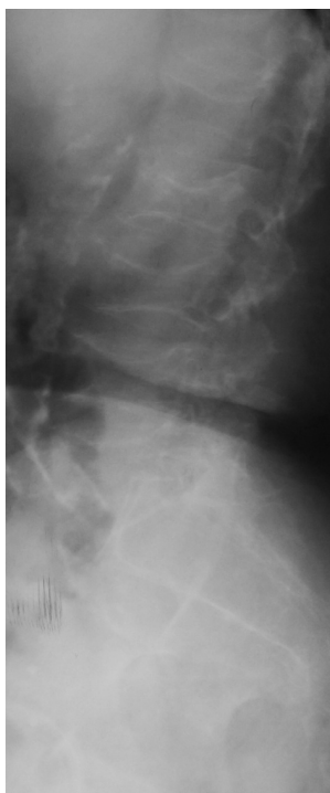
Figure 2. X-ray of lumbosacral spine with vertebral body compressive fracture

The physiatrist from the patient's place of residence asked the rheumatologist's opinion, due to suspected presence of OP.