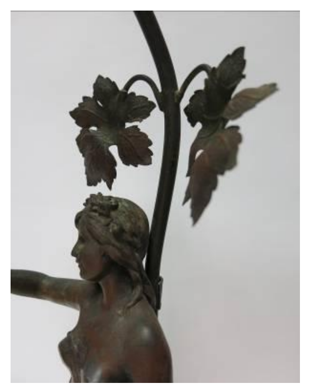
Figure 4. Part of desk lamp of interest for testing Slika 4. Deo stolne lampe od važnosti za ispitivanje