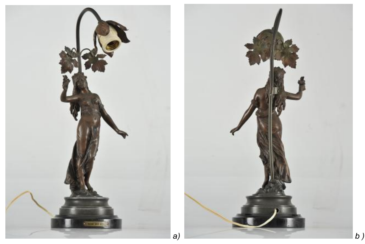
Figure 2. Front a) and back) b) view of investigated desk lamp, XIX century Slika 2. a) Pogled spreda i b) otpozadi ispitivane stolne lampe, XIX vek