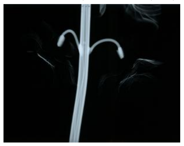
Figure 5. X-ray film of central part of desk lamp with leaves (≈1mm in thickness)