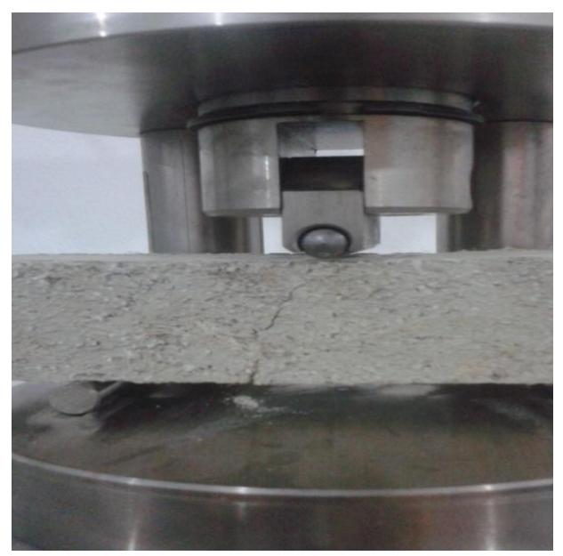
Figure 3. Operation of testing the flexural strength of composite sample

On the other side, mechanical properties were worsened because of the presence of voids. Many previous investigations have claimed that the porosity affects the flexural strength. It has been shown that the flexural strength decreases exponencially with the volume fraction porosity [12]. Along with the decrease of mechanical resistance, material has gained the ability of warning when failed. Failure of ceramic materials has always been a problem not only because as brittle they absorb low amount of energy but also because when fail they tend to collapse in an exeptional way, without warning. The failure without warning have catastrofic may consequences.