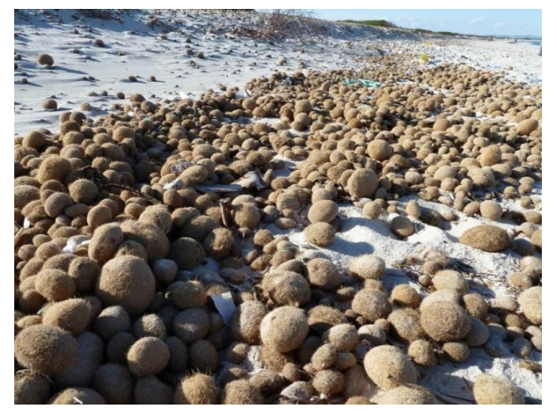
Figure 1. Posidonia Oceanica balls in the coastal area of Durres