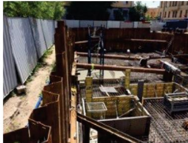
Figure 2: Additional temporary support [3]

the building. The retaining wall was 0,7 m wide, additionally supported with soil nails 6.0 - 9,0 m long. The building overturned when the excavation reached a depth of 4,6 m.