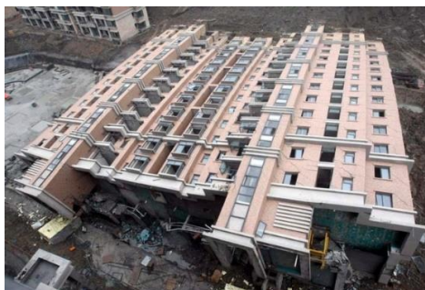
a) Overturned building number 7

The analysis [23] using the finite element method indicates that the overturning of the building occurred after the appearance of cracks in the reinforced concrete piles (Figure 3b). The cause of this overturning was a combination of excavating the soil on one side of the building and temporarily dumping the excavated material on the opposite side of the building.