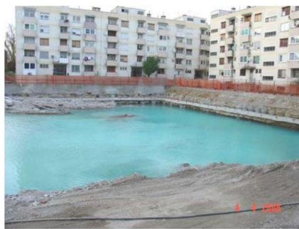
a) Controlled submersion of the pit

Despite the additional reinforcement, the problems with waterproofing and stability of the vertical protective elements were not completely solved. During further excavation, water continued to seep in intermittently. Therefore, mini talps were installed, which were sufficient to complete the construction work. (Figure 5b).