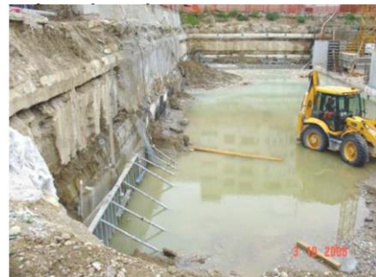
b) Application of mini piles to prevent water infiltration