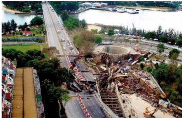
Figure 4: Location of collapsed tunnel and highway section [25]

of the existing buildings were not designed for the loads that occurred during the excavation. In addition, we can note that the human factor plays a significant role in successful construction, including decision making on the construction site during the execution.