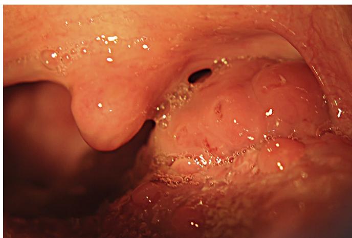
Figure 1. Oropharyngeal examination of the tongue base mass

We report the case of a 54-year old woman affected by progressively developed dysphagia for solid food but with no significant weight loss during the previous 2 years. The patient had had tonsillectomy when 5 years old because of recurrent episodes of tonsillar infection. Oropharyngeal examination revealed a smooth-surfaced, enormous overgrowth on the left side base of the tongue protruded toward the medial pharyngeal wall (Figure 1).