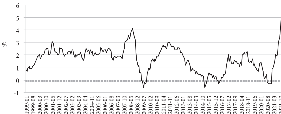
Figure 1: Inflation rates (HICP), EMU

Figure 2. shows average and extreme values of inflation rates in member countries. We can observe the diversity of inflation processes among countries, and clear departure from ECB data. In majority of countries average inflation rates do not differ so much from EMU average. The exceptions are Cyprus, with average inflation of 1.01%, Luxemburg, Spain, Estonia and Lithuania with average inflation rate above 2% and significantly above EMU average. A range of inflation rates is very high, from -2.9% in Greece, Ireland and Cyprus to 12% in Estonia and 10.7% in Lithuania. The problem is in the fact that extreme values of inflation were not realized in same or close periods, which indicate that inflation processes are not much correlated.