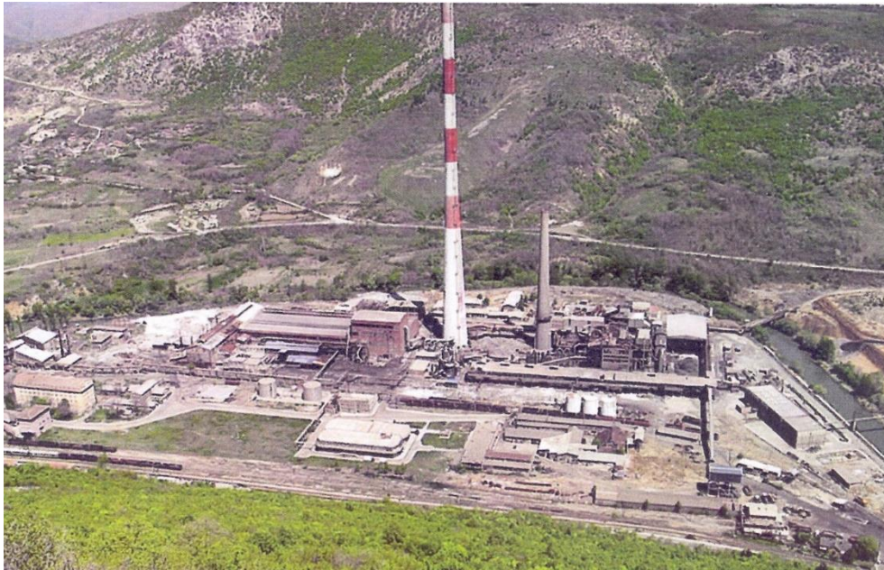
Figure 3 Industrial grounds in Zvečan after the year 1990