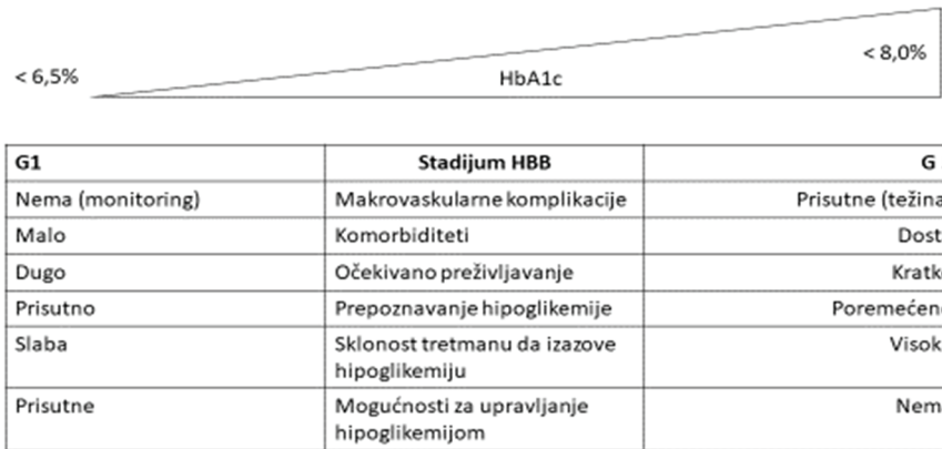
Shema 2. Faktori koji određuju vrednost HbA1c kod bolesnika sa DM i HBB 8,19

Sheme 2. Factors guiding decisions on individual glycated hemoglobin (HbA1c) targets in patients with DM and CKD 8,19