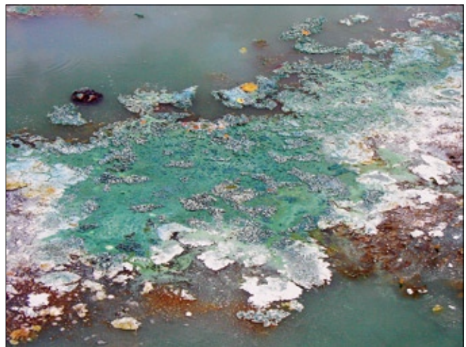
Plate 1 Cyanobacterial “bloom” in Ćelije reservoir in July 2004

concentrations measured were approximately 10 \mu\text{gL}^{-1} MC-LR equivalents. Microcystin were detected in 40% of raw water samples but usually the concentrations were less than 1 \mu\text{gL}^{-1} (Lahti et al., 2001). The results of concentration of microcystin in Portugal indicate that during the most of the sampling period (1999) cyanotoxin values were below 50 \text{ ngL}^{-1} and the highest concentration was 173 \text{ ngL}^{-1} (Caetano et al., 2001). The highest recorded and reported microcystin concentrations in samples with or without detected “blooms” are: 25,000 \mu\text{gL}^{-1} and 3,300 \mu\text{gL}^{-1} for anatoxina(S) in Germany (Chorus et al., 1998); in Japan for 1996 reported microcystin concentrations is 1,300 \mu\text{gL}^{-1} (Ueno et al., 1996), while in 1997 as high as 15,600 and 19,500 \mu\text{gL}^{-1} (Nagata et al., 1997).