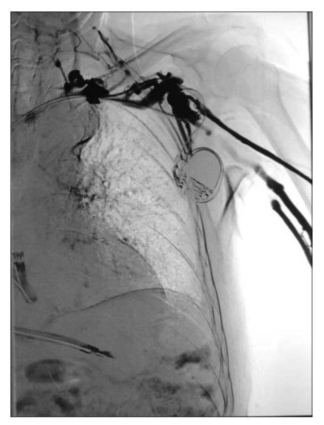
Figure 1. Digital subtraction angiography

In December 2015, the attempt to upgrade the pace-maker system to a CRT-P device was not successful due to venous thrombosis of the subclavian vein on the left side. It was decided to administer oral anticoagulation therapy and to try to implant a lead for coronary sinus on the left side again in two months. During the next hospitalization, before the re-intervention, digital subtraction angiography was done. The venous occlusion was verified (Figure 1), so an alternative solution was needed. We decided to try to implant the LV lead on the right side, than to shift it to