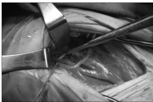
Figure 3. Intraoperative findings; the right internal carotid artery reconstructed with end-to-end anastomosis

through a typical longitudinal incision on the right side of the neck. The aneurysm and the kinked segment of the ICA were dissected. The aneurysm was located approximately 5 cm from the carotid bifurcation, and about 1.5 cm distally from the hypoglossal nerve (Figure 2). After systemic heparin administration, carotid arteries were clamped (without shunt insertion), the aneurysm was resected and the ICA was reconstructed with an end-to-end anastomosis (Figure 3). Clamping time was 7 minutes.