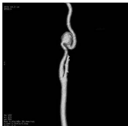
Figure 1. Multislice computed tomography angiography; the right internal carotid artery aneurysm associated with medial kinking

The patient underwent surgery in general anesthesia. Carotid arteries were exposed