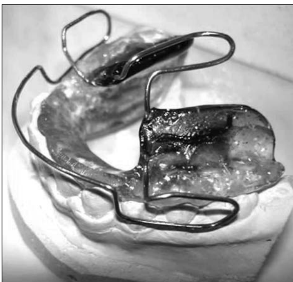
Figure 3. Balters' bionator type I

growth spurt period, which is a crucial prerequisite for functional orthodontic treatment. The average chronological age of patients before the beginning of treatment was 10 years and one month, and the average dental age was nine years and five months. Skeletal age analysis of pretreatment records revealed the following data: in Group I, three patients were in stage 1 (10%), 22 patients in stage 2 (73%), and five patients in stage 3 (17%); in Group II, nine patients were in stage 1 (45%), seven patients in stage 2 (35%), and four patients in stage 3 (20%); in Group III, four patients were in stage 1 (20%), nine patients in stage 2 (45%), and seven patients in stage 3 (35%). The average treatment time was 15 months in Group I, 20 months in Group II and 22 months in Group III. The patients' age, treatment time, and sex distribution are shown in Table 1.