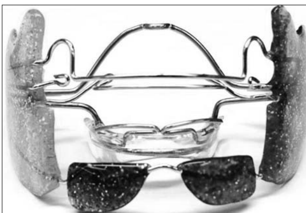
Figure 2. Fränkel functional regulator type I

Standard diagnostic procedure was performed, which included anamnesis, clinical and functional examination, study model analysis, panoramic radiograph analysis, and cephalometric analysis. Dental age was estimated according to the method developed by Demirjian et al. [8]. Skeletal age was determined using the modified Cervical Vertebral Maturation method described by Baccetti et al. [9]. According to age assessment, all patients were in the pre-pubertal