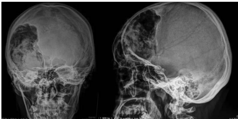
Figure 1. Skull X-ray showing extradural lytic bone lesion.

A routine X-ray of the skull was made and lesion of the frontal bone was detected (Figure 1). A magnetic resonance imaging (MRI) brain scan showed an enhancing extradural lytic bone lesion of 6.16 \times 7.21 cm in size, well-defined hyperdense, on T2-weighted image, mass lesion in the right frontal lobe without perilesional edema (Figure 2). Preoperative cerebral