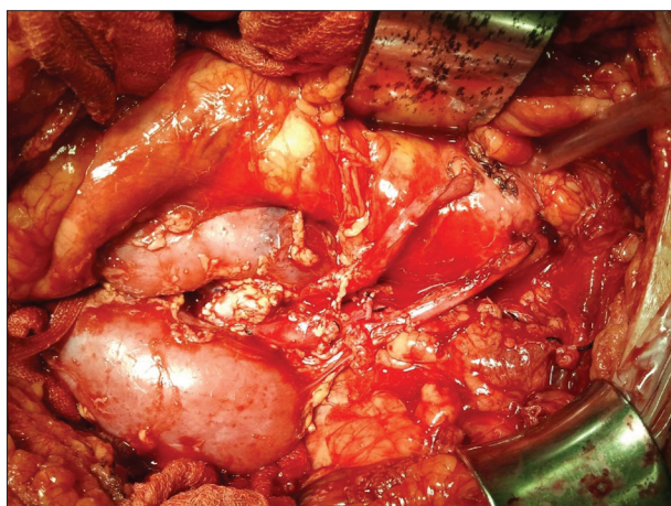
Figure 3. Separate uretero-cysto-neostomies for both ureters

Abdominal ultrasonography showed kidneys' enlargement ( 8 \times 4 \times 2 cm). Moreover, no signs of hydronephrosis, perirenal, or retroperitoneal collections were recorded. Good flow through arterial and venous anastomosis, and good perfusion of both kidneys were recorded by a color Doppler