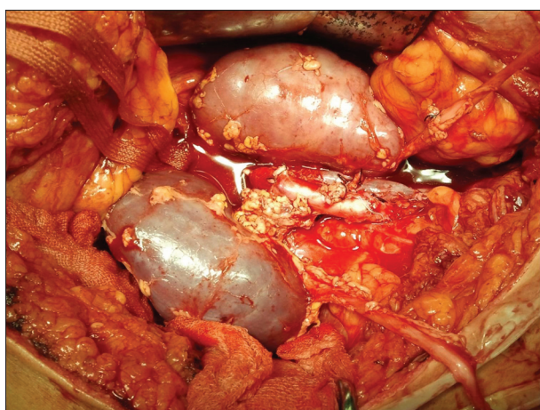
Figure 2. Sutured proximal end of the infant's aorta and the inferior vena cava; end-to-side anastomosis of the infant's inferior vena cava to the recipient's external iliac vein; end-to-side anastomosis of the infant's aorta to the recipient's external iliac artery