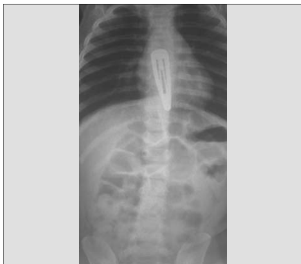
Figure 1. Anteroposterior X-ray – a long hairpin retained in the esophagus