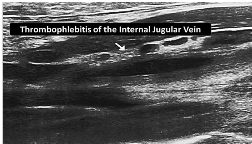
Figure 2. Ultrasound imaging of thrombophlebitis of the left internal jugular vein

strains of fusobacteria to create beta-lactamase in 22.7% of the cases [15–18]. Metronidazole is generally considered the drug of choice for this type of infection. The weak resistance of anaerobes to this antibiotic, good resorption, and bioavailability of the drug enable simple oral administration, and a rapid therapeutic effect [6, 15, 19, 20]. Antibiotic therapy in Lemierre's syndrome is required within the range of three to six weeks, while intravenous administration of antibiotics may be replaced by the per os one when a patient becomes afebrile [6, 13, 18]. Administration of antibiotics in the period of six weeks represents the optimal period for curing due to difficult penetration of the drug in the clot. A period of curing shorter than two weeks may lead to a relapse [6]. The benefits and risks of the anticoagulation therapy in Lemierre's syndrome still have to be clarified [6].