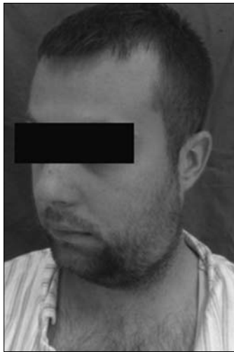
Figure 1. Swelling of the left neck side