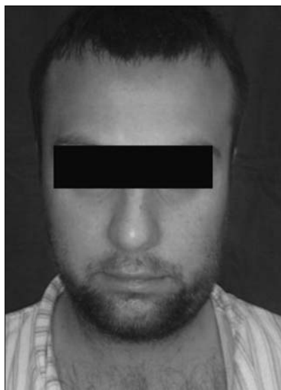
Figure 3. Regression of swelling of the left side of the neck after seven days of therapy