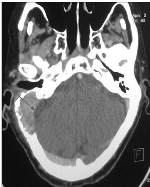
Figure 1. Computed tomography scan: osteolytic tumor of the right temporal bone with extension into the parietal bone and soft-tissue. Arrow shows compressive effect on the middle temporal gyrus of the brain.

pleural effusion as well as osteolysis of third and fourth right ribs, sternum and several thoracic vertebrae.