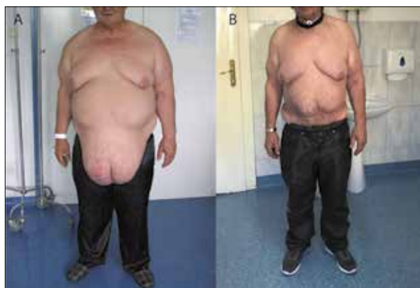
Figure 1. The superobese 54-year-old patient before the operation (A) and one year later (B)