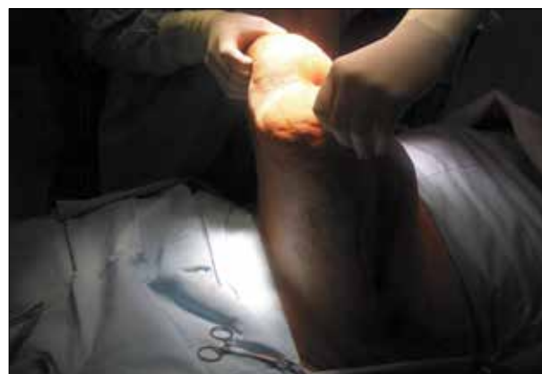
Figure 4. Preparation for panniculectomy

The operation begins with intraoperative direct and rigid laryngoscopy and temporary intubation with tracheal tube No. 6. Excision of the scar tissue was done after identification of the tracheal restenosis in loco of the subglottic-tracheal junction (Figure 3). Re-tracheostomy was performed and cannula No. 9 was placed and fixed for further airway support for the procedure. The patient was placed in the French position and laparoscopic sleeve