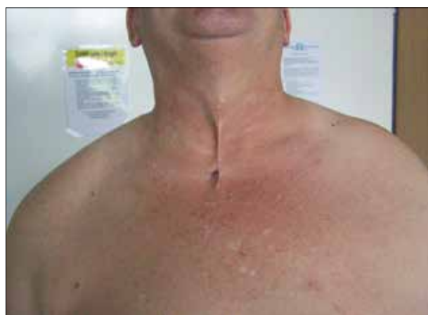
Figure 2. The scar from the previous tracheal operation