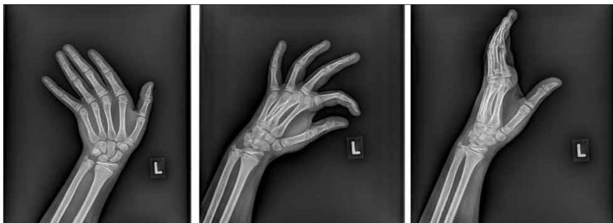
Figure 4. X-ray at the one-year follow-up: correct position of the pisiform bone

volar aspect of the wrist or as a consequence of an indirect force such as a forceful muscular contraction in a minority of cases [4]. As the center of ossification of the pisiform bone appears between 7.5 and 10 years of age and the pisiform is not always clearly visualized, diagnosing pisiform fracture and dislocation in children could be very challenging [6].