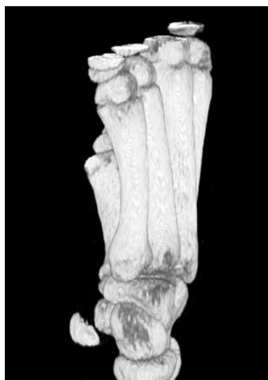
Figure 2. Three-dimensional volume rendering of spiral computed tomography scan shows dislocation of the pisiform bone