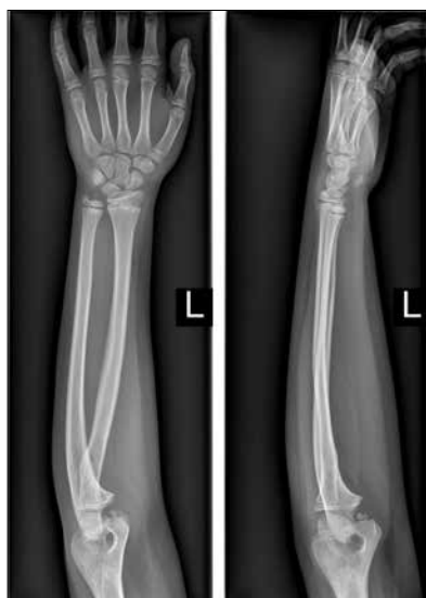
Figure 1. Initial radiographic presentation: X-ray clearly shows the pisiform bone dislocation