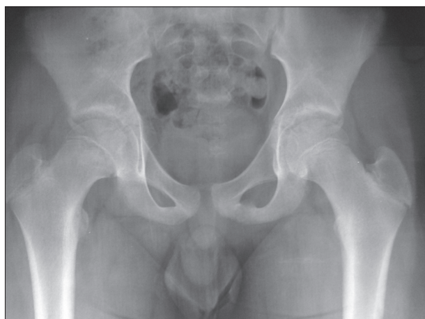
Figure 1. Anteroposterior view of slipped capital femoral epiphysis (right hip affected) before treatment