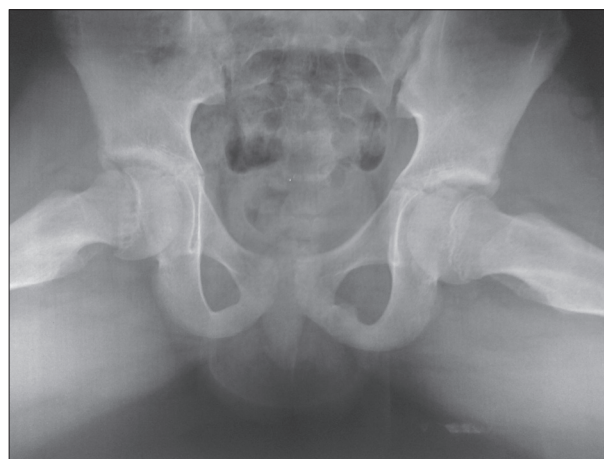
Figure 2. “Frog leg” view of slipped capital femoral epiphysis (right hip affected) before treatment