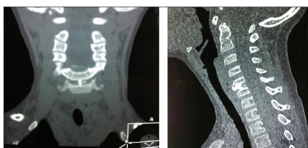
Figure 2. Computerized tomography scan of cervical spine without contrast; calcified lesion between C4 and C5 vertebrae

sistent and with no pathological changes. There were signs of sclerosation of the inferior plateau of the C4 vertebral body and on the superior plateau of the C5 vertebral body.