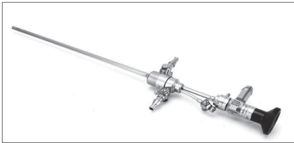
Figure 4. Bettocchi office operative hysteroscope