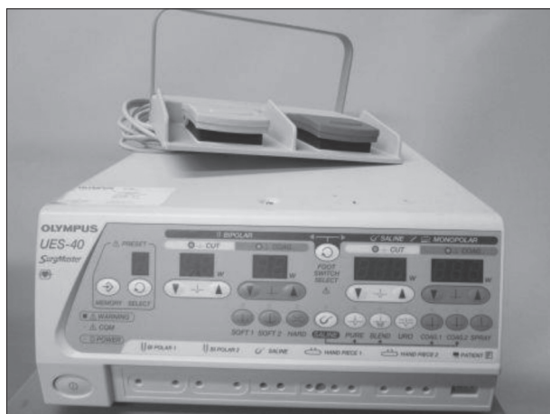
Figure 6. Olympus UES-40 SurgMaster electro-surgical unit

generator, as a source of monopolar and bipolar energy, which enables the utilization of the bipolar resectoscope in normal saline (Figure 6).