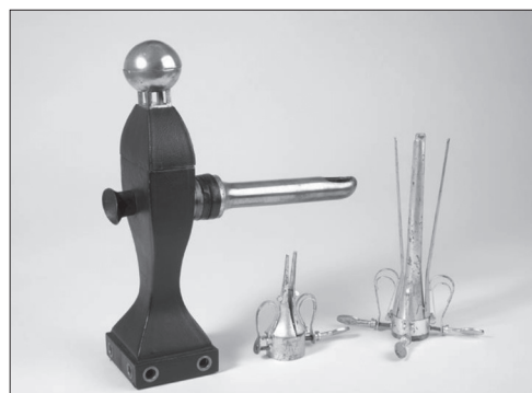
Figure 1. Bozzini's Lichtleiter or light conductor

Modern hysteroscopy originates from Philip Bozzini's articles in 1807 where he described the endometrial cavity, the existence of intra-uterine tumours and malformations. He used a candle and a concave mirror as an illumination method (Figure 1). In 1853, Desormeaux developed the first cystoscope, and it was used to perform the first cystoscopy [2]. The cystoscope had two channels, one for introduction of liquids and the other for instruments. He used