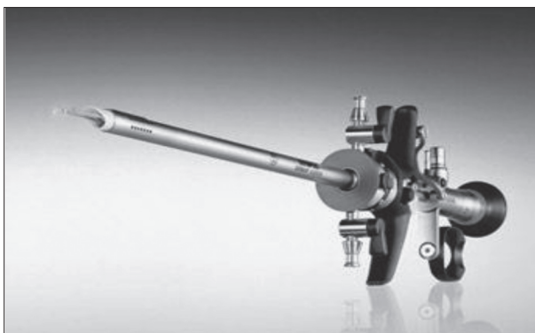
Figure 5. Olympus bipolar resectoscope

sodium chloride and Quinones-Guerrero (1976) used 5% dextrose [9, 10].