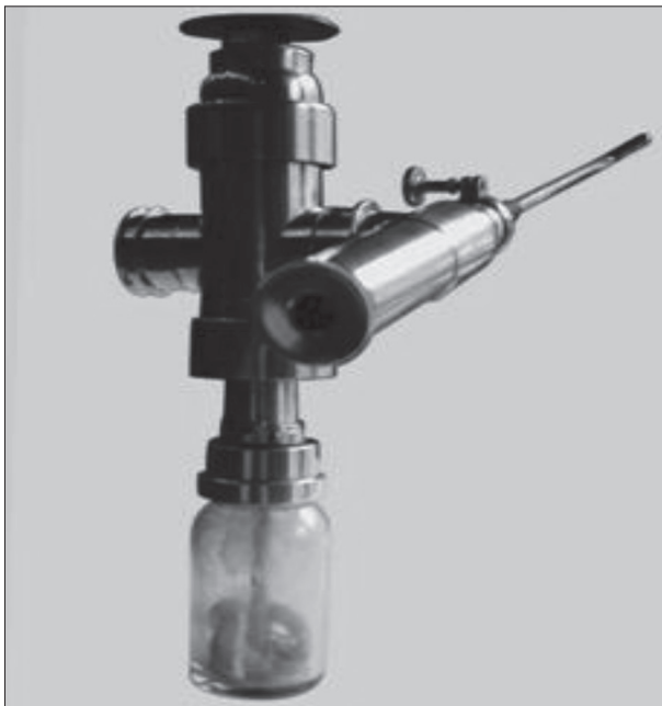
Figure 2. Desormeaux's endoscope

a lamp and a concave mirror as an illumination method (Figure 2).