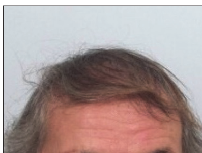
Figure 3. The same patient 10 months after transplantation