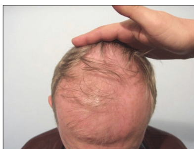
Figure 4. Patient before surgery