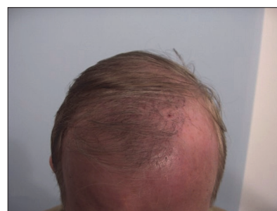
Figure 5. The same patient seven months after surgery

dle, laser or Choi's single-hair implantation [7, 21, 22, 23] needle and so on. There are two problems associated with these methods: one is bleeding, and the other is wrong determination of the direction of future hair growth.