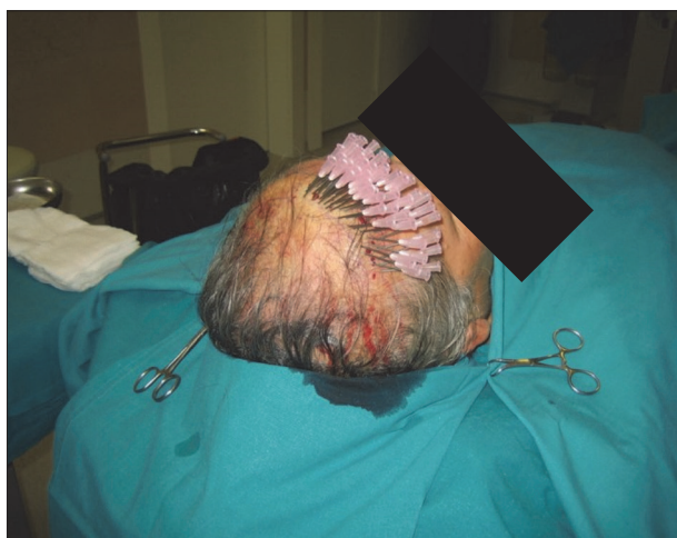
Figure 1. Needles are inserted in the direction of hair growth.