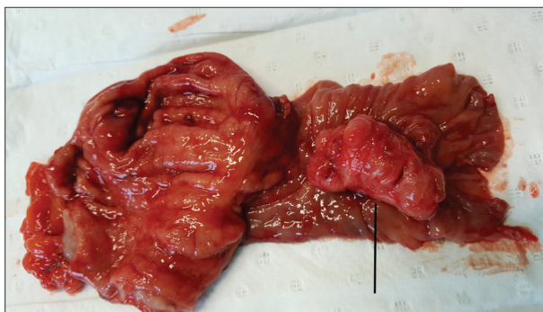
Figure 3. Postoperative view; the arrow shows the excised specimen with gastrointestinal stromal tumor

Biopsies taken during endoscopy of the tumor revealed that it was an undifferentiated inflammatory tumor. Due to the recent severe myocardial infarction, the placement of a drug-eluting stent in the coronary arteries and the necessity for anticoagulation therapy, the patient was offered the option of delaying the operation.