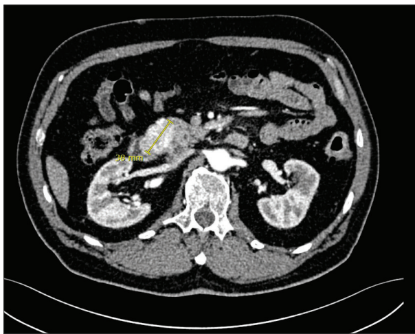
Figure 2. Abdominal computed tomography scan shows the tumor measuring 38 mm with uneven margins and possible infiltration of the pancreas