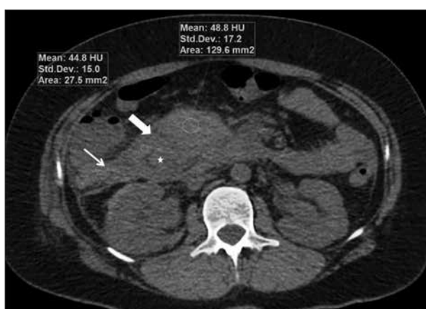
Figure 3. Non-contrast abdominal CT – axial scan: thickened and hyperdense D2 duodenal wall (average attenuation 44.8 HU) (white star: lumen of the duodenum), with hyperdense periduodenal mass (thick arrow; average attenuation 48.8 HU), represents intramural and periduodenal hematoma; also notice right perirenal hematoma (thin arrow)

intramural and extra luminal bleeding, difficult endoscopic diagnosis in case of massive intraluminal and intramural bleeding and poor results of surgical treatment. Surgical