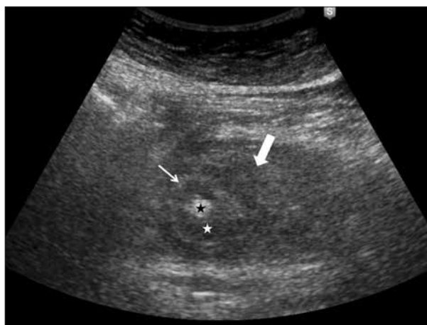
Figure 1. Transabdominal ultrasonography – axial ultrasound scan in the right hypochondrium: thickened and homogenous hypoechoic D2 duodenal wall (white star, thin arrow), with the hypoechoic periduodenal mass (thick arrow), represents intramural and periduodenal hematoma (black star indicates narrowed duodenal lumen)

Gastrointestinal hemorrhage can be life-threatening due to frequent subclinical manifestations, possibilities of