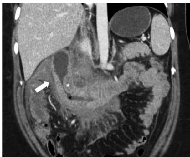
Figure 4. Contrast enhanced abdominal CT – multiplanar coronal reconstruction: thickened and predominantly hyperdense D2 and D3 duodenal wall (white star), with luminal narrowing, and hyperdense periduodenal mass (thick arrow), represents intramural and periduodenal hematoma

treatment should be considered when there is no evidence of partial resolution after conservative treatment, or in cases of perforation or peritonitis, which increases the size of the hematoma [13, 14].