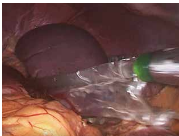
Figure 4. Removal of the spleen with an endobag

treated with low-molecular-weight heparin. After induction of general endotracheal anesthesia, the patient was positioned in the right hemilateral position, i.e. the "hanging or leaning spleen" technique [8]. After port placement and