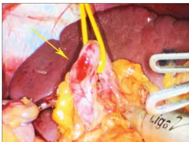
Figure 2. Intraoperative photo: splenic artery aneurysm pulled with a yellow rubber band