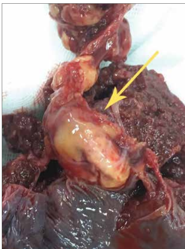
Figure 5. Operative specimen with splenic artery aneurysm

insertion of a laparoscope, the examination of the abdomen confirmed the preoperative finding. An aneurysm of the splenic artery in the hilum of the spleen was identified. We first mobilized the spleen by cutting the splenic ligaments and short gastric vessels with a laparoscopic harmonic scalpel. After complete mobilization of the spleen, we started the preparation of aneurysm and its separation from the surrounding structures (Figure 2). After preparation of the artery, a few centimeters proximally from the aneurysm, we placed two hem-o-lok clips proximally and one distally, and then cut the artery (Figure 3). The splenic vein was treated the same way. After taking care of the elements of the hilum, the spleen was completely separated from the surrounding structures, placed in the endobag