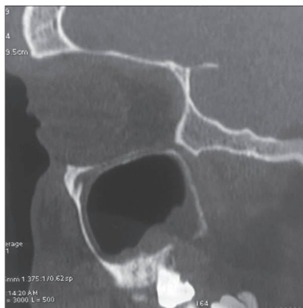
Figure 2. Computed tomogram of patient S; before surgery: the defect of the alveolar process of the right upper jaw, the fistula of the right maxillary sinus with the oral cavity, and thickening of the sinus mucosa are visualised

palpation, and the symptom of fluctuation was positive. When examining the area of a previously removed tooth 1.8, the defect of the alveolar process of the upper jaw was visualized in the retromolar region, with a transition to the vestibular side up to 1.5–1.8 cm. The nasal test was positive. Puncturing the line of mucous membrane closure of the right buccal area, pus was obtained. Abscess of the buccal region on the right and chronic odontogenic sinusitis with oroantral fistula on the right were diagnosed.