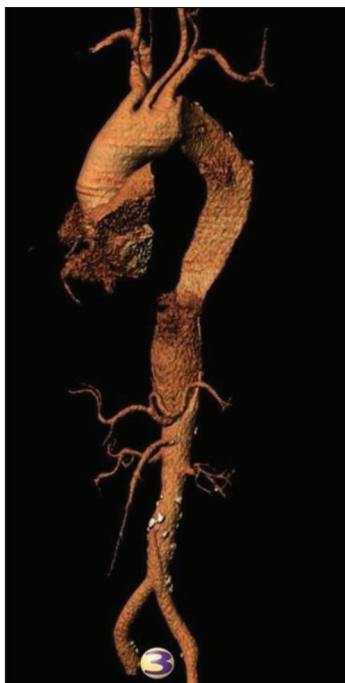
Figure 1. Multidetector computed tomography with angiography in volume rendering reconstruction; a chronic dissecting aneurysm of the thoracic aorta