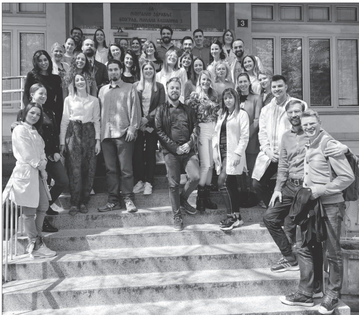
Figure 4. The future of Institute of Mental Health – young specialists, residents, and psychologists of the Institute

epidemiological research at the Institute was continued. In addition to epidemiological, the Institute also conducts other types of research. On average, about 30 research outputs per year are conducted at the Institute, as part of the post-graduate training of academics or larger, multidisciplinary research groups.