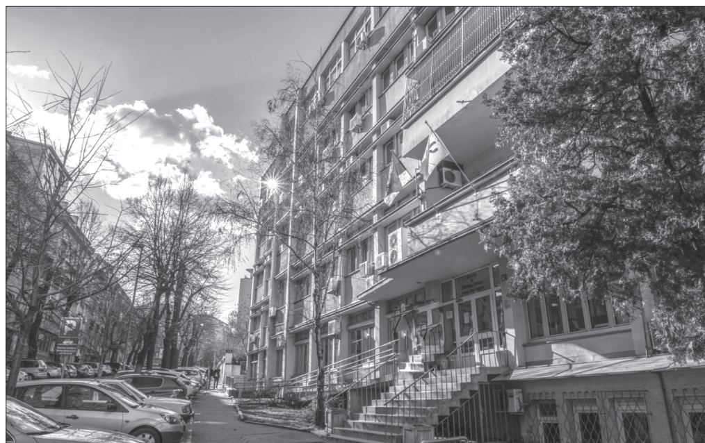
Figure 1. The Institute of Mental Health, 2023

Caring for people with mental health problems in Serbia began more than 160 years ago, with the opening of Doctor’s Tower, as