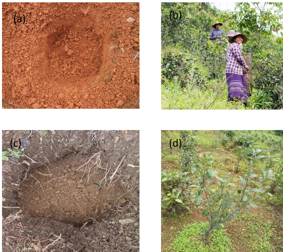
Figure 2. Soil morphology of the locations 1 (a, b) - tea site and 2 (c, d) - apple site.

30 min. Afterwards, the solution was placed for overnight and then analyzed on an Atomic Absorption Spectrophotometer. The standard solution was prepared in an acid mixture similar to that of the sample solution. The wavelengths were set up at 422 nm, 228 nm, 257 nm, 766 nm, 283 nm, 213 nm, 248 nm, and 279 nm, corresponding for individual elements.