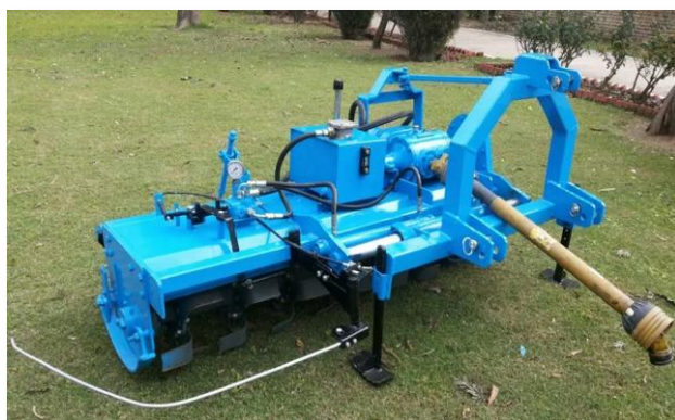
Fig. 3. Side shift tiller