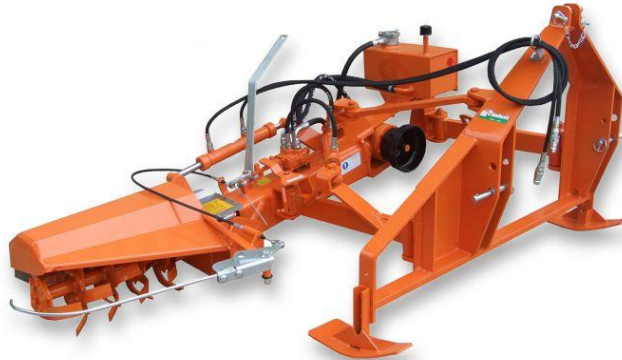
Fig. 1. Rinieri offset tiller

Department of Farm Machinery and Power Engineering, College of Technology, Govind Ballabh Pant University of Agriculture and Technology, Pantnagar (Uttarakhand). The views of different orchard tillers are shown in Figure 1, Figure 2 and Figure 3 whereas their technical and brief specifications are tabulated in Table 1, Table 2, Table 3, Table 4 and Table 5.