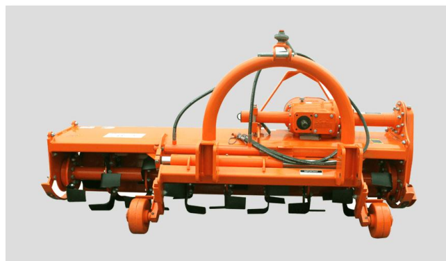
Fig. 2. Shaktiman offset tiller