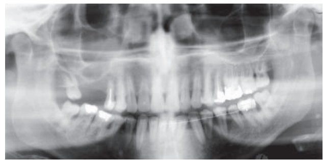
Figure 3. Progress OPG shows the supernumerary premolar brought to occlusion