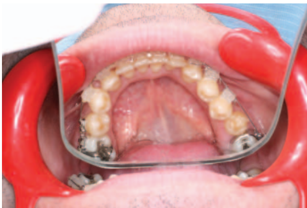
Figure 2. Occlusal view of the mandibular arch