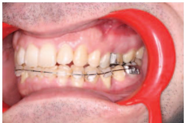
Figure 4. Intra-oral photograph in centric, showing the supernumerary premolar in occlusion