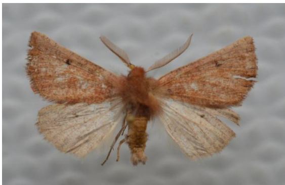
Figure 3a. D. modesta (Staudinger, 1879): Gnjilane, Gornje Kusce, 16. April 2018. Male, adult.