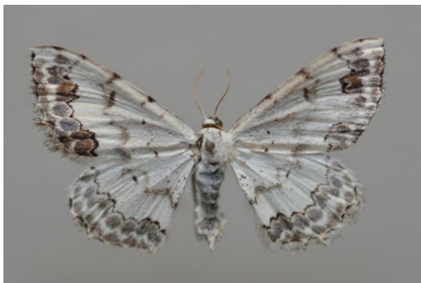
Figure 8. S. decorata ([Denis & Schiffermüller], 1775): Pasjane, 6. June 2018., Female, adult.