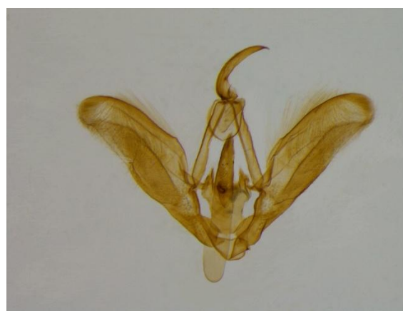
Figure 1. E. cordiaria (Hübner, 1790): Gnjilane, Gornje Kusce, 7. May 2018., Male genitalia.

7622 Eilicrinia cordiaria (Hübner, 1790): Gnjilane, Gornje Kusce, 7. May 2018., Genitalia checked, slide SR-3120 (Fig. 1).