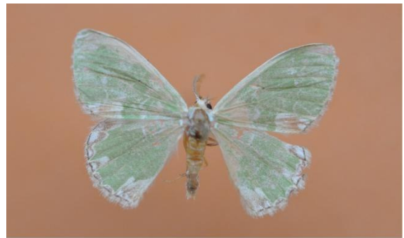
Figure 6a. C. bajularia ([Denis & Schiffermüller], 1775): Leposavić, 24. May 2018., Male adult.