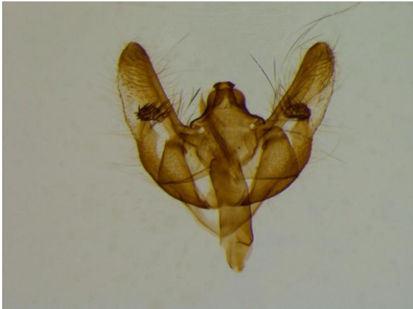
Figure 4b. P. pilosaria ([Denis & Schiffermüller], 1775). Šarplanina, Vrbeštica, 1011 m, 1. Mart, 2019. Male genitalia.