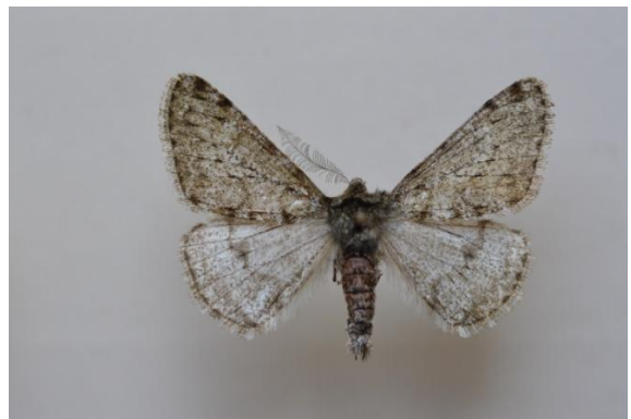
Figure 4a. P. pilosaria ([Denis & Schiffermüller], 1775). Šar-Planina, Vrbeštica, 1011m, 1. Mart, 2019. Male adult.

7672 Phigalia pilosaria ([Denis & Schiffermüller], 1775): Vrbeštica, 1. March 2018., 4m. Genitalia checked, slide SR-3125 (Figs.4a & 4b). Đorović (1976, 1979, 1992) reported this species for K & M.