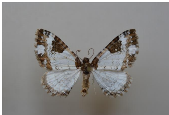
Figure 9. M. procellata ([Denis & Schiffermüller], 1775) Šar-Planina, Štrpce, 890 m, 20. May 2019., Female.