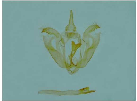
Figure 3b. D. modesta (Staudinger, 1879): Gnjilane, Gornje Kusce, 30. Mart 2018. Male, genitalia.

7661 Asovia maeoticaria (Alphéraky, 1876): Gnjilane, Gornje Kusce, 13. April 2018., 1f. So far, for Serbia this species reported Djuric & Hric (2013) and Beshkov (2015). New species for K & M.