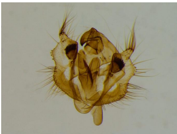
Figure 5. E. defoliaria (Clerck, 1759), Bostane (Novo Brdo), 10. December 1982. Male genitalia.