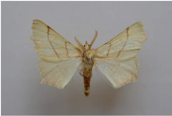
Figure 2a. E. erosaria ([Denis & Schiffermüller], 1775): Leposavić, 26. May 2018., Male adult.

April 2018., 3m; Gnjilane, Stanišor, 5.–22. April 2018., 3m, Genitalia checked. (Figs. 3a & 3b).